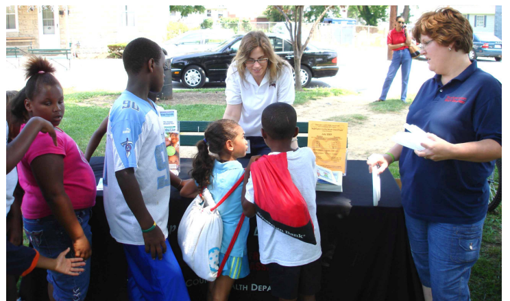
Smoking facts and free Frisbees provided by the Washington County Health Department's Stop Smoking For Life program